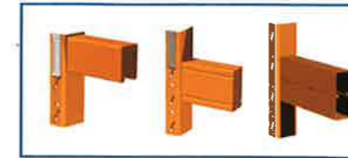
A versatile range of beam sections

Maximum storage flexibility and versatility