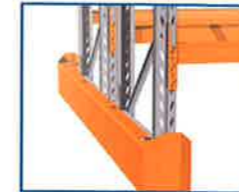
Rack end protection for safe operation