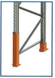
Front and rear upright protectors minimise damage

Lowest cost. Highest flexibility. Selective pallet racking is the most popular storage system for palletised goods. It provides ready access to every pallet location for a relatively low capital investment.